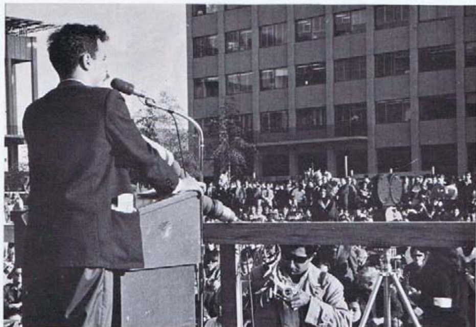
Jerry Rubin, fresh from visiting Castro's Cuba, addresses the "teach-in."

On hand at the park to greet the fifteen thousand marchers were fifteen clean-cut students of a patriotic bent. Although the odds were more than a trifle un-even, the marchers wanted no part of the patriots. Discussion between the pro-Americans and a couple of dozen marchers remained relatively calm until one of the beatniks made the statement that Communist Ho chi Minh based his regime on the principles of the American Declaration of Independence. Shortly thereafter the police stepped in to protect the fifteen thousand from the fifteen.