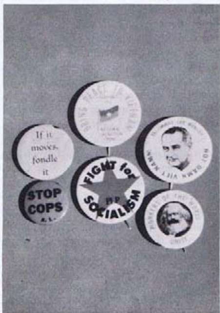
Buttons sold at Sather Gate.

Many there were rejoicing that years of apathy had given way to a new era of "social consciousness" and revolutionary youth. Included in the "socially conscious" groups with tables there on the Berkeley campus was the W.E.B. DuBois Clubs of America, named after the American Negro "reformer" and founder of the N.A.A.C.P. who joined the Communist Party officially in Ghana after renouncing his American citizenship. F.B.I. Director J. Edgar Hoover has described the DuBois Clubs, founded in San Francisco, as being "spawned" by the Communist Party. Some of you who are "out of step with the times" might think that this would be enough to have the organization banned from the campus, but they are very "Liberal" about such things at the University of California.