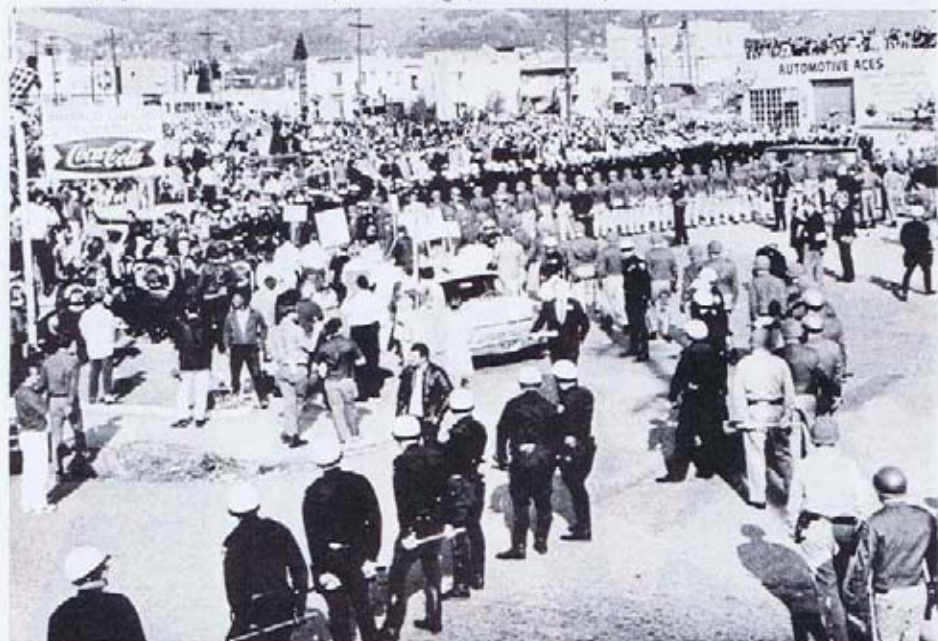
Oakland Police confront the Communist-led marchers and refuse to let them pass.

Back on campus it was obvious why the leaders had taken the parade to a park in downtown Berkeley rather than return to the school. Saturday Cal was to play the University of Washington in football, and as it was Parent's Day, there would be thousands of visitors on campus. Gone from the campus plaza were the revolutionary placards, gone were the tables advocating abortion, draft evasion, and revolution. Why, it looked like a school, a school where students could come and learn without having their University turned into a circus by a handful of misfits and criminals, many of whom are not even en-