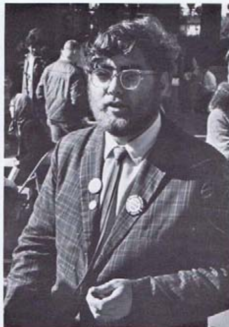
At the Independent Socialist booth.

use every weapon of terror to crush resistance, the people must build and train their own self-defense organizations. . . . The ruling class is weaker than it appears. In Los Angeles it needed the entire strength of California's National Guard to occupy 120 [sic] square miles of territory.