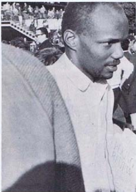
Hawking the Communist "Peking Review."