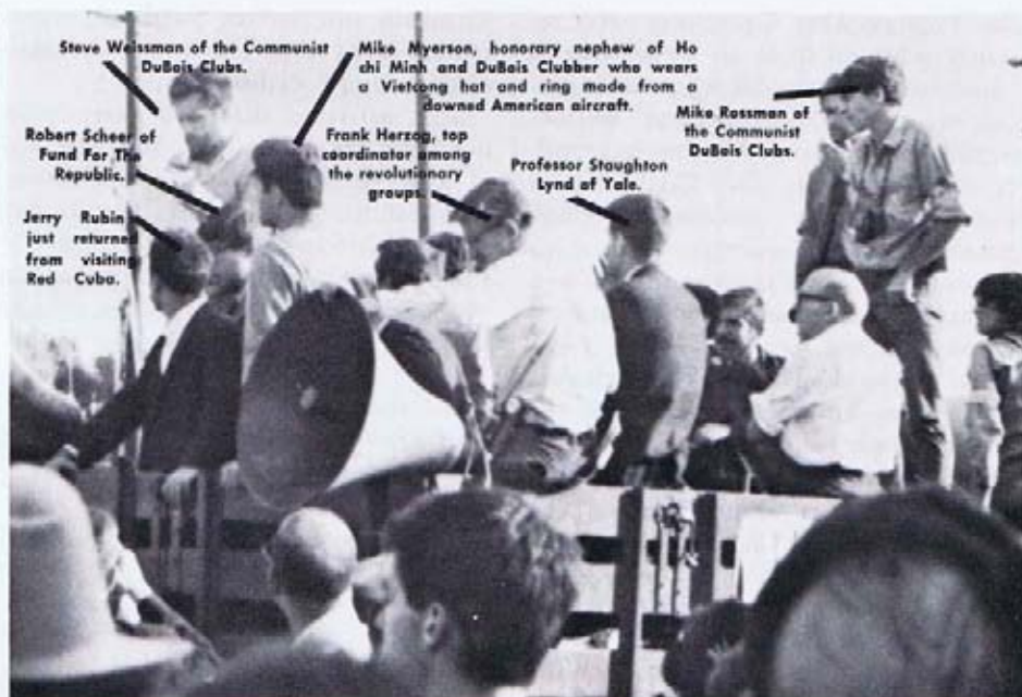
Young revolutionaries address the pro-Vietcong from the bed of a truck.

that their freedom of speech was being violated because all they were allowed to do was stop traffic; it was, they said, a right of free speech to invade a defense base. They vowed to keep trying and threatened to turn Oakland into another Selma—whatever that meant.