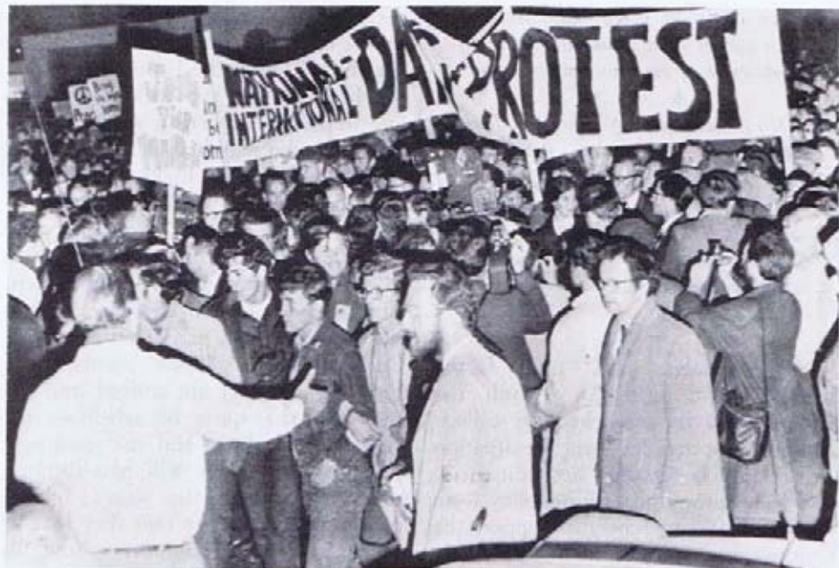
The Friday night march. Notice the monitor in the foreground.

of . . . professors and teaching assistants deliberately indoctrinating their students in an attempt to gain support for the FSM.